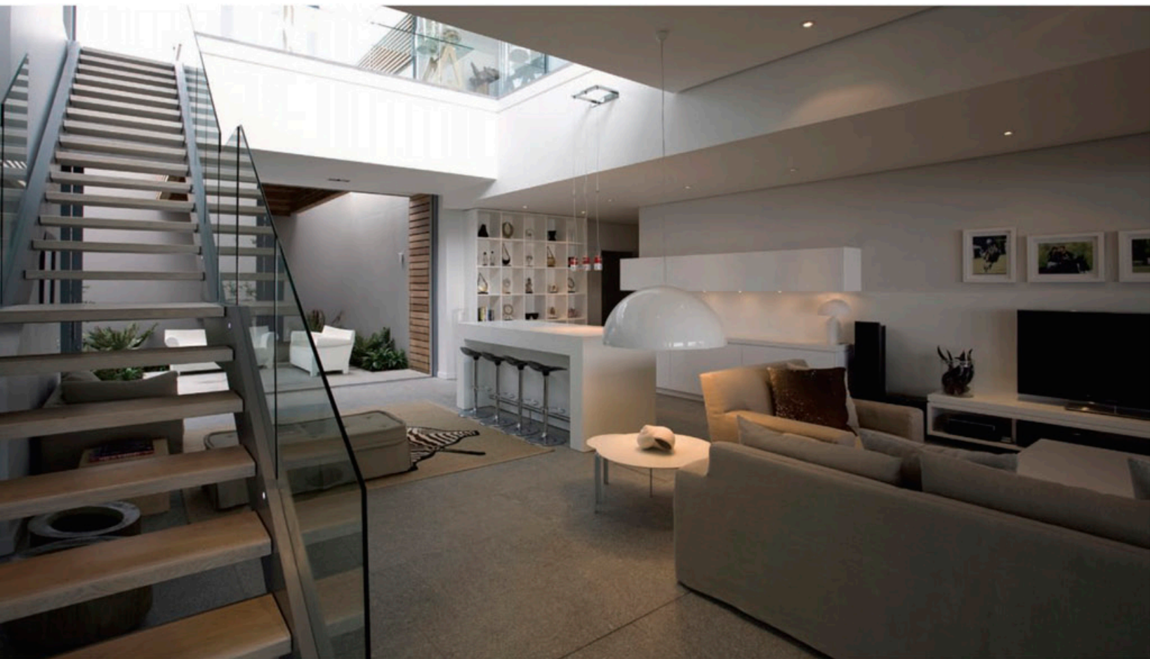
Staircase and living room

"Flueless gas fireplaces are built in flamed Rustenberg Granite plinths. The master bedroom is finished with white oiled Oak flooring with feature granite, tying it back to the rest of the house. The high-gloss kitchen is topped with seamless dove grey Corian counter tops," the press statement added.