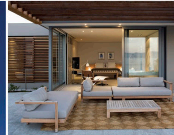
External Resting Area

A pleasant seaside habitat is just what any family needs to escape wear and tear of their everyday lifestyle, especially when life in the city has become even more demanding than ever. Stefan Antoni Olmesdahl Truen Architects (SAOTA) had chosen Plettenberg Bay, known for being a well known South African summer get away to help one of their clients realize their vacation fantasies.