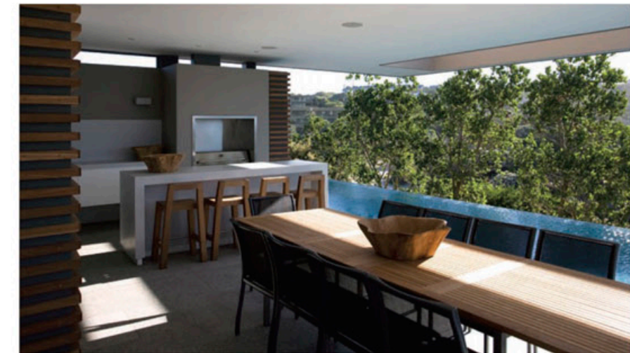
Eating Area and Bar