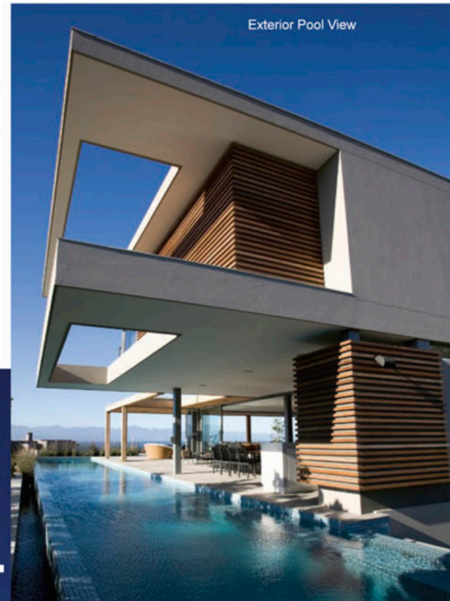
Exterior Pool View