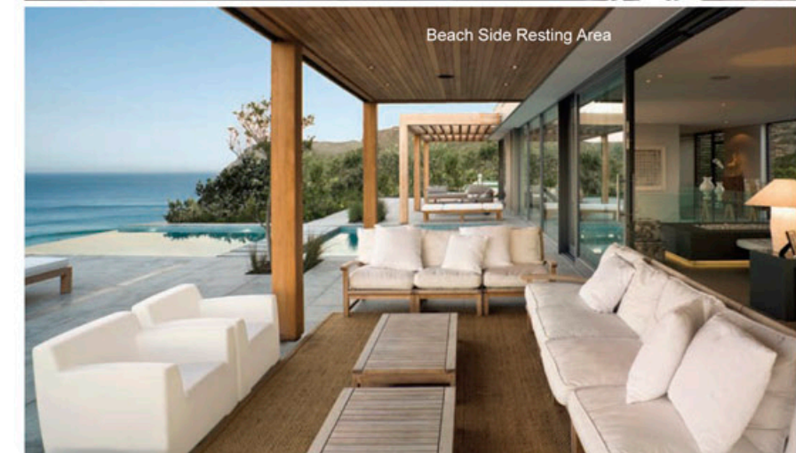
Beach Side Resting Area